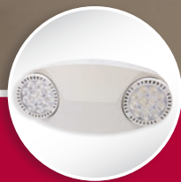
Sure-Lites p. 57-59