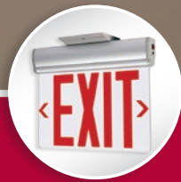
AtLite p. 62-63