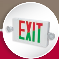
All-Pro p. 60-61