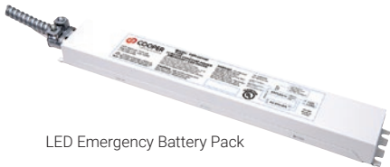
LED Emergency Battery Pack